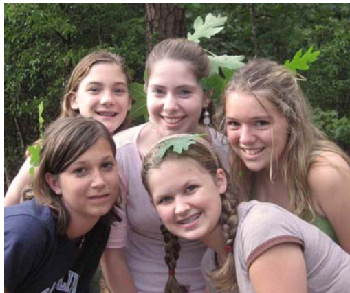
Our youth pose while camping at Rollingview